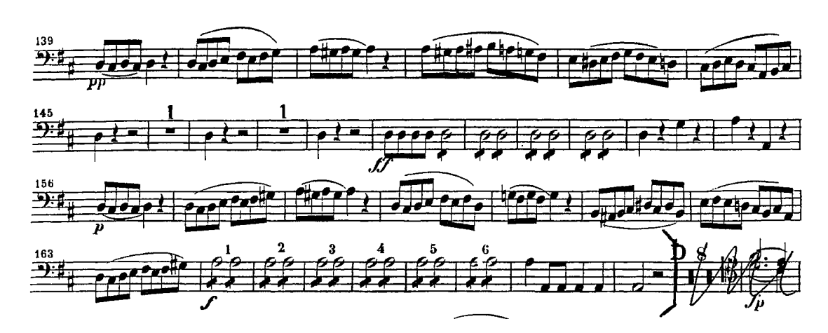
Mozart — The Marriage of Figaro, K. 492: Overture Fagott\ I/II