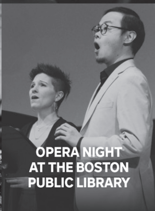
OPERA NIGHT AT THE BOSTON PUBLIC LIBRARY