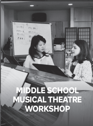
MIDDLE SCHOOL MUSICAL THEATRE WORKSHOP