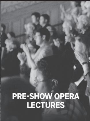
PRE-SHOW OPERA LECTURES