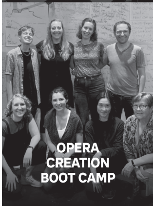
OPERA CREATION BOOT CAMP