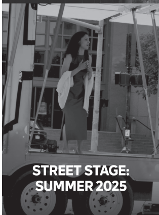
STREET STAGE: SUMMER 2025