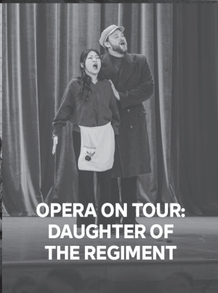
OPERA ON TOUR: DAUGHTER OF THE REGIMENT