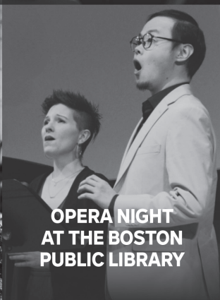
OPERA NIGHT AT THE BOSTON PUBLIC LIBRARY