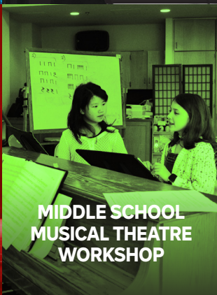
MIDDLE SCHOOL MUSICAL THEATRE WORKSHOP