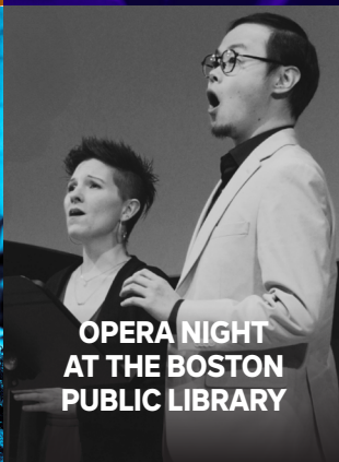
OPERA NIGHT AT THE BOSTON PUBLIC LIBRARY