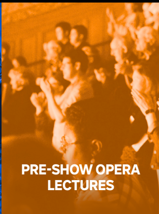
PRE-SHOW OPERA LECTURES