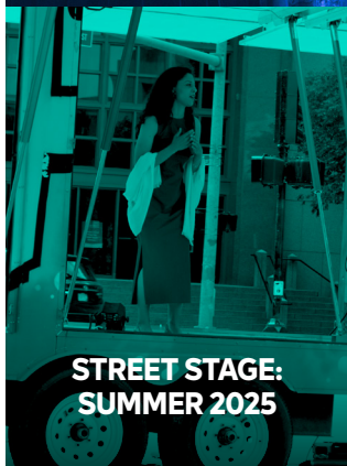
STREET STAGE: SUMMER 2025