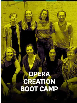
OPERA CREATION BOOT CAMP