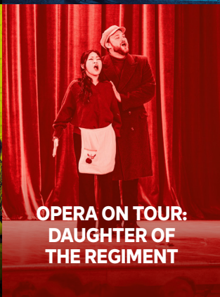
OPERA ON TOUR: DAUGHTER OF THE REGIMENT